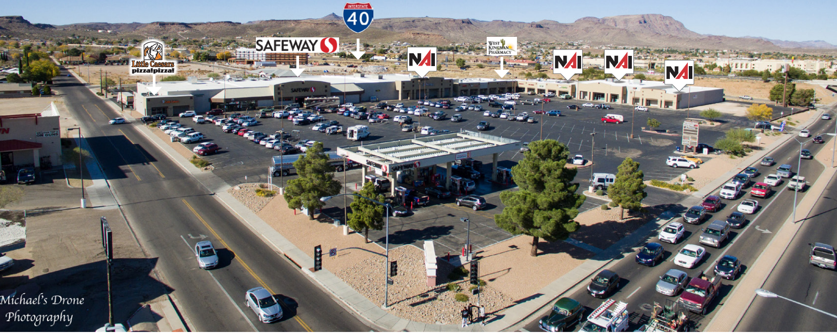
Michael's Drone Photography