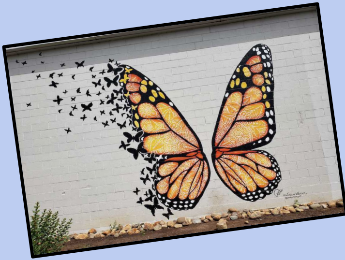
"Wings of Wander" Sevierville, Tennessee.