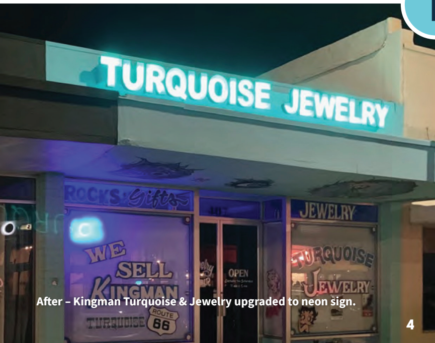
After – Kingman Turquoise & Jewelry upgraded to neon sign.